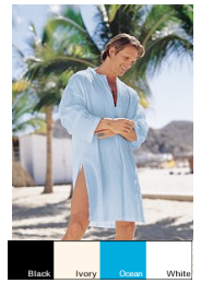
3. THE GAUZE CAFTAN