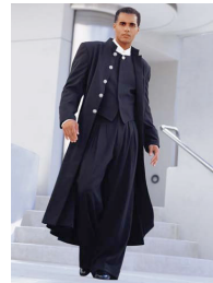
1. THE LONDON OPERA TRENCHCOAT

For the dramatist in you... in all of us. Crafted of fine rayon/polyester gabardine. Stand proud and envelop all in your presence with your sweeping sense of flair.